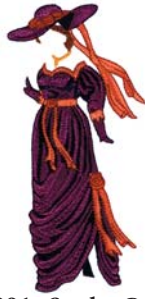
NY091 Garden Dress 2.87 X 6.05 in. 72.90 X 153.67 mm 30,482 St. L