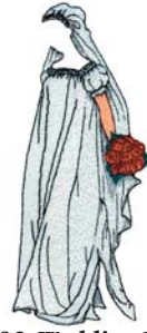
NY092 Wedding Dress 2.66 X 6.08 in. 67.56 X 154.43 mm 22,751 St. L