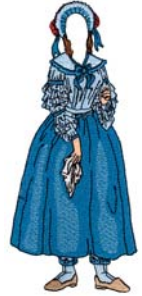
NY104 Playful Sophie 2.68 X 6.11 in. 68.07 X 155.19 mm 20,041 St. L