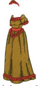
NY094 Summer Dress 2.22 X 5.75 in. 56.39 X 146.05 mm 19,033 St. L