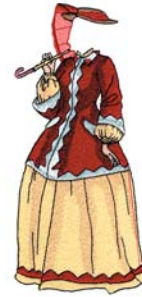
NY098 Summer Parasol 2.93 X 5.93 in. 74.42 X 150.62 mm 23,131 St. L