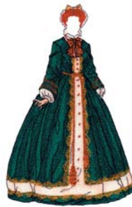
NY107 Holiday Dress 4.07 X 6.45 in. 103.38 X 163.83 mm 43,366 St. L