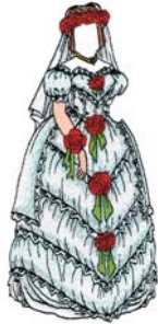
NY101 Wedding Dress 2.79 X 5.99 in. 70.87 X 152.15 mm 27,483 St. L