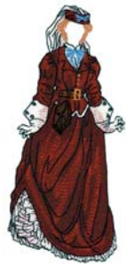
NY109 Riding Dress 2.87 X 6.40 in. 72.90 X 162.56 mm 31,267 St. L