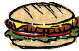
NY366 Burger 2.97 X 1.86 in. 75.44 X 47.24 mm 13,032 St. ⚙️