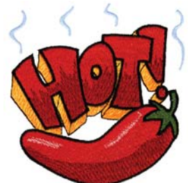
NY372 Hot! 3.32 X 3.45 in. 84.33 X 87.63 mm 15,737 St. ⚙️