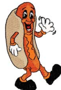
NY380 Mr. Hot Dog 2.17 X 3.44 in. 55.12 X 87.38 mm 10,433 St.