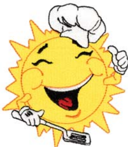
NY378 Sunny Chef 3.10 X 3.47 in. 78.74 X 88.14 mm 11,842 St. ⚙️