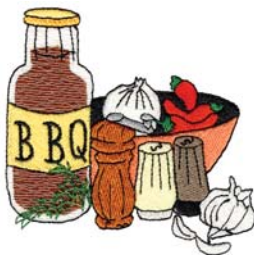
NY368 Barbeque Fixings 3.50 X 3.34 in. 88.90 X 84.84 mm 14,598 St. ⚙️⚙️