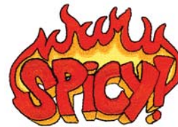
NY371 Spicy! 3.50 X 2.42 in. 88.90 X 61.47 mm 14,721 St. ⚙️