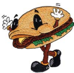
NY379 Mr. Burger 3.50 X 3.30 in. 88.90 X 83.82 mm 15,259 St. ⚙️