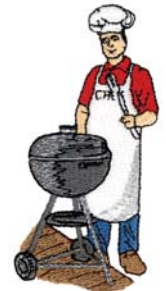
NY382 The Chef 1.76 X 3.51 in. 44.70 X 89.15 mm 9,090 St. ⚙️

⚙️ Design contains a loose fill. ⚙️ Some white areas shown are not stitched.