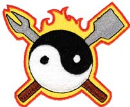
NY369 Yin-Yang Chef 3.51 X 2.88 in. 89.15 X 73.15 mm 12,649 St.