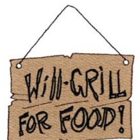
NY377 Will Grill 3.29 X 3.50 in. 83.57 X 88.90 mm 13,941 St. ⚙️