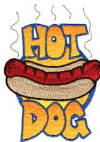
NY370 Hot Dog 2.43 X 3.47 in. 61.72 X 88.14 mm 15,882 St. ⚙️