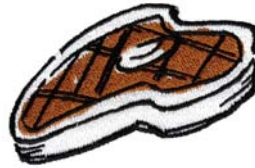
NY365 Steak 2.84 X 1.82 in. 72.14 X 46.23 mm 9,121 St.