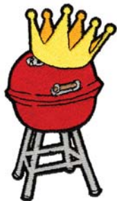
NY373 Grill 1.93 X 3.41 in. 49.02 X 86.61 mm 8,798 St. ⚙️