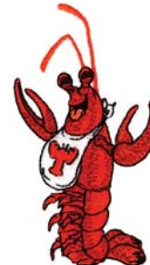
NY381 Mr. Lobster 1.90 X 3.52 in. 48.26 X 89.41 mm 8,470 St. ⚙️