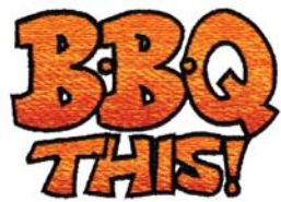
NY374 BBQ This! 3.48 X 2.41 in. 88.39 X 61.21 mm 14,682 St. ⚙️