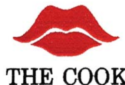
NY376 Kiss The Cook 3.51 X 2.37 in. 89.15 X 60.20 mm 4,982 St. ⚙️