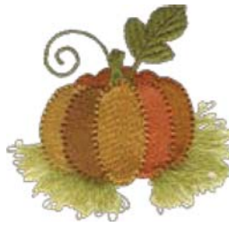
CM306_48 Loopy Pumpkin 2.40 X 2.48 in. 60.96 X 62.99 mm 6,586 St. ❁❁