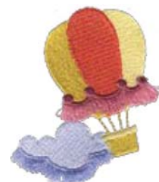
CM322_48 Loopy Balloon 2.25 X 2.87 in. 57.15 X 72.90 mm 5,620 St. ❁