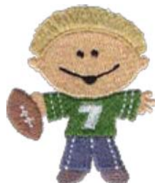
CM320_48 Loopy Boy 1.82 X 2.19 in. 46.23 X 55.63 mm 4,604 St.