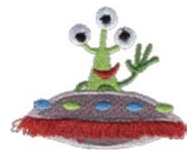
CM323_48 Loopy Alien 2.41 X 2.02 in. 61.21 X 51.31 mm 5,124 St. ❁

❁ Design contains a loose fill. ❁ Some white areas shown are not stitched.