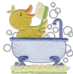
CM321_48 Loopy Bathtime 2.79 X 2.87 in. 70.87 X 72.90 mm 7,659 St. ❁