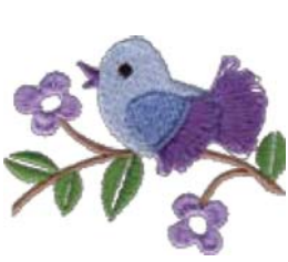
CM304_48 Loopy Bird 2.53 X 1.93 in. 64.26 X 49.02 mm 4,367 St. ❁