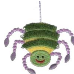
CM312_48 Loopy Spider 2.69 X 2.75 in. 68.33 X 69.85 mm 5,124 St. ❁