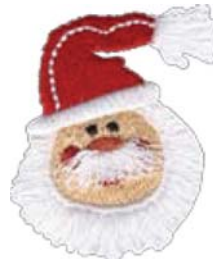
CM311_48 Loopy Santa 1.46 X 1.94 in. 37.08 X 49.28 mm 4,007 St. ❁S