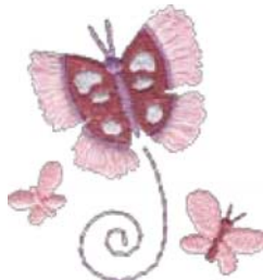
CM305_48 Loopy Butterfly 2.22 X 2.31 in. 56.39 X 58.67 mm 4,030 St. ❁