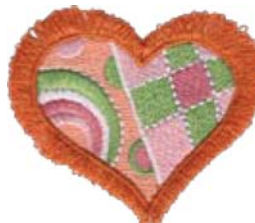
CM316_48 Loopy Heart 2.09 X 1.81 in. 53.09 X 45.97 mm 5,344 St. ❁