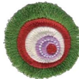
CM307_48 Loopy Circle 1.61 X 1.56 in. 40.89 X 39.62 mm 2,977 St. ❁