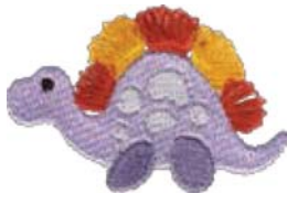
CM315_48 Loopy Dinosaur 2.45 X 1.56 in. 62.23 X 39.62 mm 4,259 St. ❁