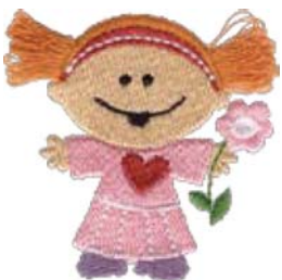
CM319_48 Loopy Girl 2.00 X 2.22 in. 50.80 X 56.39 mm 5,202 St.