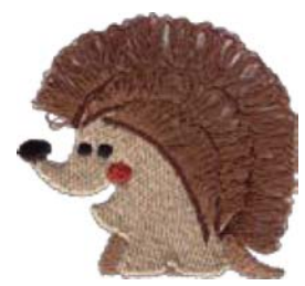
CM313_48 Loopy Hedgehog 2.01 X 1.88 in. 51.05 X 47.75 mm 4,907 St.