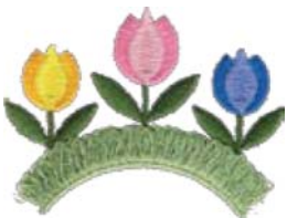
CM309_48 Loopy Tulips 2.60 X 1.91 in. 66.04 X 48.51 mm 4,198 St.