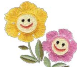
CM318_48 Loopy Flowers 2.08 X 2.00 in. 52.83 X 50.80 mm 3,247 St.