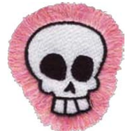
CM308_48 Loopy Skull 1.90 X 2.16 in. 48.26 X 54.86 mm 5,237 St. ❁