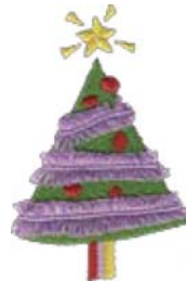
CM310_48 Loopy Christmas Tree 1.88 X 3.03 in. 47.75 X 76.96 mm 4,885 St. ❁