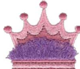
CM317_48 Loopy Crown 1.87 X 1.74 in. 47.50 X 44.20 mm 5,217 St. ❁