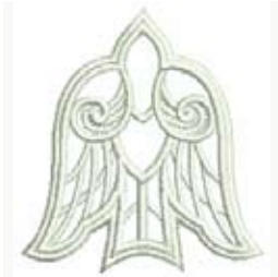
OC00507 FSL Lace Dove Cutwork 2.02 X 2.20 in. 51.31 X 55.88 mm 5,477 St.