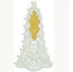
OC00505 FSL Lace Large Bell Piece Appliqué 4.60 X 8.54 in. 116.84 X 216.92 mm 45,591 St. L