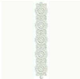
OC00516 FSL Lace Napkin Ring .83 X 5.07 in. 21.08 X 128.78 mm 9,960 St. L S