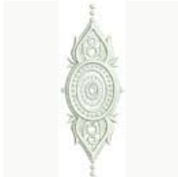
OC00506 FSL Lace Fancy Cutwork 1.50 X 4.25 in. 38.10 X 107.95 mm 8,838 St.