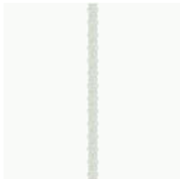
OC00511 FSL Lace Ribbon 2 .83 X 13.33 in. 21.08 X 338.58 mm 27,584 St. L S