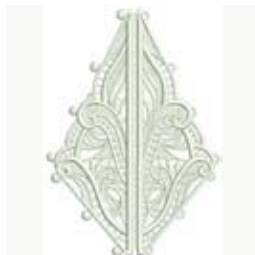
OC00521 FSL Lace Large Star Piece All Lace 3.60 X 5.16 in. 91.44 X 131.06 mm 26,092 St. L

Note: Some designs in this collection may have been created using unique special stitches and/or techniques. To preserve design integrity when rescaling or rotating designs in your software, always rescale or rotate designs using the handles directly on-screen.