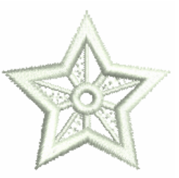
OC00509 FSL Lace Star Cutwork 1.55 X 1.47 in. 39.37 X 37.34 mm 1,820 St. S