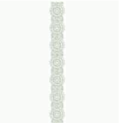
OC00510 FSL Lace Ribbon 1 .83 X 6.67 in. 21.08 X 169.42 mm 13,787 St. L S