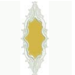
OC00520 FSL Lace Large Globe Piece Blank with Appliqué 3.50 X 9.32 in. 88.90 X 236.73 mm 29,736 St. L

⊞ Design contains a loose fill. ⊞ Some white areas shown are not stitched.