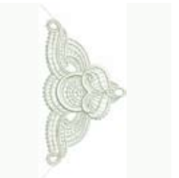
OC00515 FSL Lace Placemat Corner 2.94 X 6.04 in. 74.68 X 153.42 mm 19,872 St. L