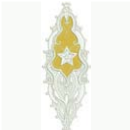
OC00517 FSL Lace Large Globe Piece with Star Appliqué & Cutwork 3.49 X 9.31 in. 88.65 X 236.47 mm 37,131 St. L