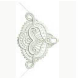
OC00514 FSL Lace Napkin Corner 2.09 X 3.88 in. 53.09 X 98.55 mm 9,436 St.