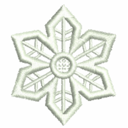
OC00508 FSL Lace Snowflake Cutwork 1.58 X 1.82 in. 40.13 X 46.23 mm 3,231 St.