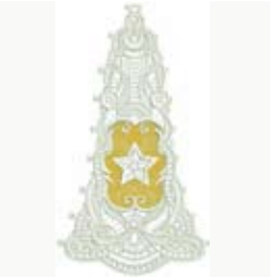
OC00504 FSL Lace Large Bell Piece With Star Appliqué & Cutwork 4.66 X 8.50 in. 118.36 X 215.90 mm 42,831 St. L