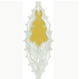
OC00519 FSL Lace Large Globe Piece with Appliqué 3.49 X 9.31 in. 88.65 X 236.47 mm 35,181 St. L