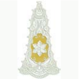
OC00503 FSL Lace Large Bell Piece With Snowflake Appliqué & Cutwork 4.66 X 8.50 in. 118.36 X 215.90 mm 42,831 St. L