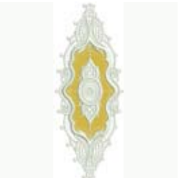
OC00518 FSL Lace Large Globe Piece with Appliqué & Cutwork 3.52 X 9.32 in. 89.41 X 236.73 mm 39,623 St. L