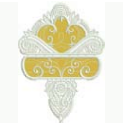
OC00513 FSL Lace Name Card Holder Appliqué 4.76 X 6.83 in. 120.90 X 173.48 mm 36,294 St. L