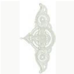
OC00512 FSL Lace Tree Skirt Edging 5.27 X 11.01 in. 133.86 X 279.65 mm 52,986 St. L